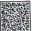
(Archana Badhe - Naware) I/c Registrar